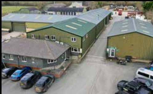
Kingsland Head Office

Powell & Co Construction Ltd Longmoor, Shirlheath, Kingsland, Leominster, Herefordshire, HR6 9RG