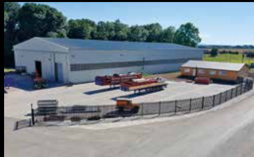
Shobdon Steel Fabrication Site